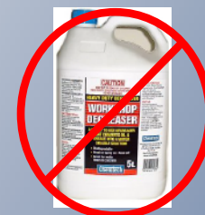
No Degreasers or Detergents